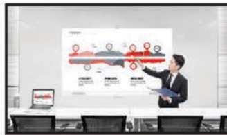
Education and training